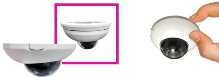
YUC-D08 Bracket (Optional)